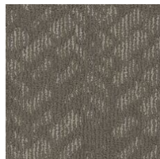
Cadence 27740 LRV 15.1