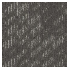
Interval 27770 LRV 9.8