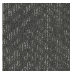
Orchestrate 27550 LRV 11.8