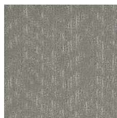
Calm 27120 LRV 27.1