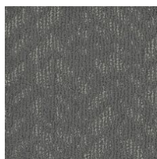
Pitch 27540 LRV 15.6