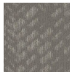
Pause 27720 LRV 22.1